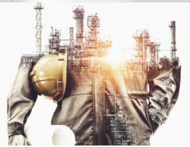
LOCAL CONTENT POLICY 2020